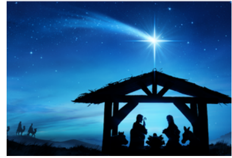
Class Advent Prayer Services